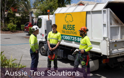
Aussie Tree Solutions