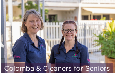
Colomba & Cleaners for Seniors