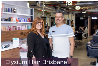
Elysium Hair Brisbane