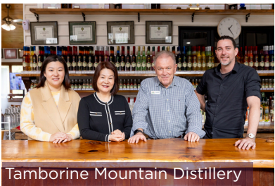
Tamborine Mountain Distillery