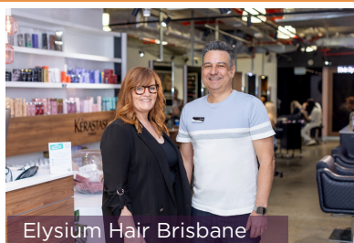
Elysium Hair Brisbane