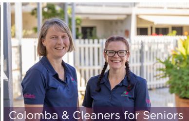
Colomba & Cleaners for Seniors