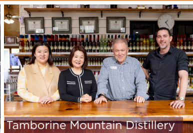
Tamborine Mountain Distillery