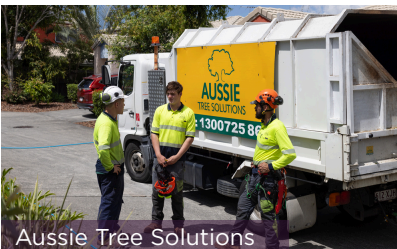
Aussie Tree Solutions